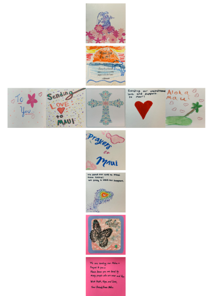
Messages of hope and cards received by the mission community on Maui.

For updates from the mission community on Maui visit their website ( https://www.mauimission.org/ ).